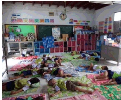
Figure 5: Children taking a 1 h nap in the afternoon.

The process for improving the capacity of participants in this study was composed of six steps modified from the five-step UNDP framework 15,16 . Reinforcement was added as a step up before the final evaluation step (Fig6). All activities were divided into four phases: preparation, implementation, reinforcement and evaluation.