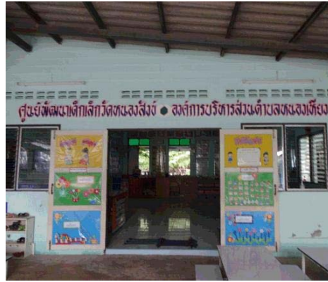
Figure 3: Childcare center established by a Local Authority Organization.