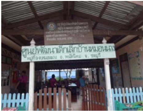
Figure 2: Childcare center established by a temple.