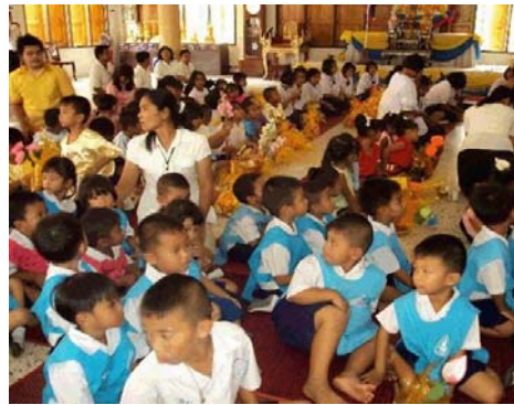
Figure 4: Some childcare centers are crowded, without enough space per child for some activities.